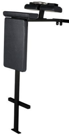
Brutal Bench Art.nr: 174

Length: 75 cm Width: 50 cm Height: 160 cm