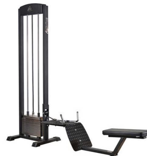
Row Seated Art.nr: 210

Read more about each product on our website: www.gymleco.com