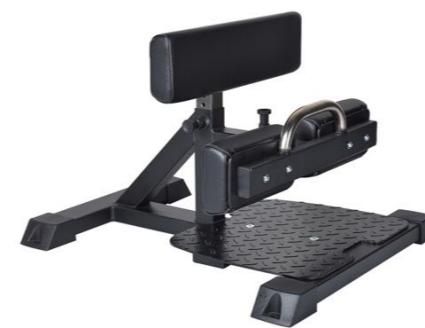
Sissy Squat Art.nr: 144

Length: 77 cm Width: 64 cm Height: 57 cm