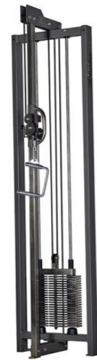
Half of a Cable Cross Art.nr: 225B

Length: 48 cm Width: 58 cm Height: 225 cm