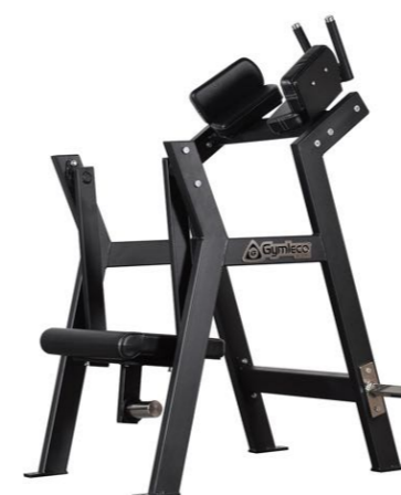
Ab Roll up Art.nr: 072

Length: 100 cm Width: 96 cm Height: 140 cm