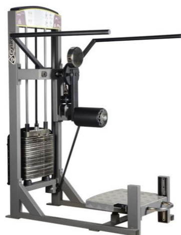
Multihip Art.nr: 369

Length: 115 cm Width: 110 cm Height: 160 cm