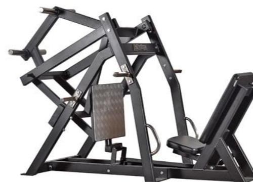
Leg Press Art.nr: 043

Length: 226 cm Width: 78 cm Height: 180 cm