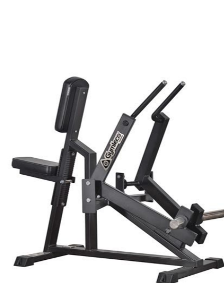
Seated Row Art.nr: 010

Length: 150 cm Width: 75 cm Height: 115 cm