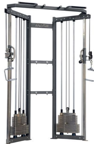
Dual Adjustable Pulley Art.nr: 226

Length: 151 cm Width: 77 cm Height: 228 cm