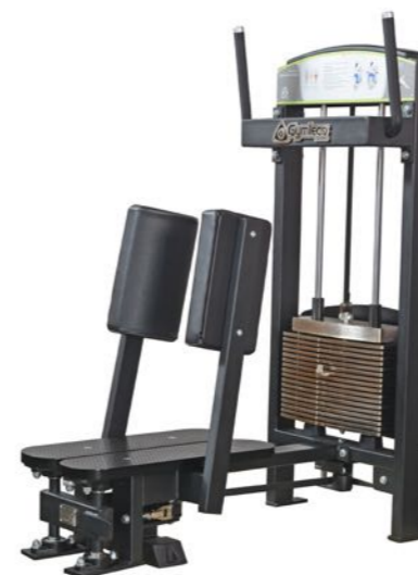
Abductor Standing Art.nr: 362

Length: 110 cm Width: 65 cm Height: 142 cm