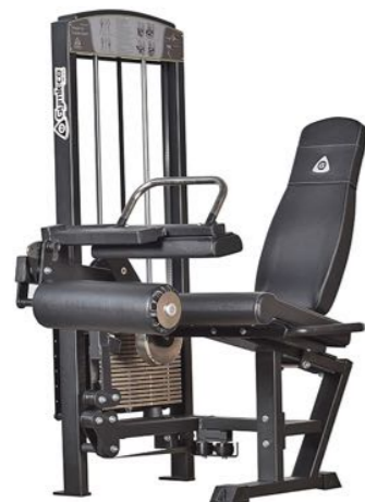
Leg Extension/Leg Curl Combination Art.nr: 349

Length: 115 cm Width: 99 cm Height: 163 cm