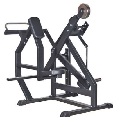
Lateral Gluteus Rotation Art.nr: 060

Length: 126 cm Width: 119 cm Height: 133 cm