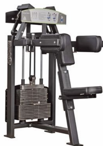
Shoulder Rotation Seated Art.nr: 331

Length: 87 cm Width: 75 cm Height: 135 cm