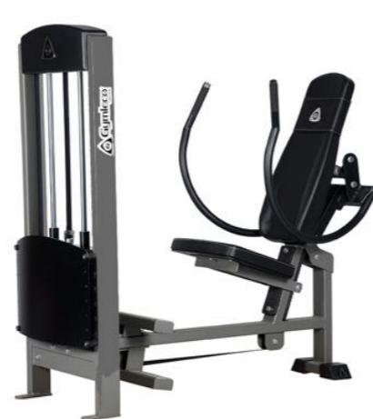
Triceps Machine Art.nr: 351

Length: 130 cm Width: 60 cm Height: 140 cm