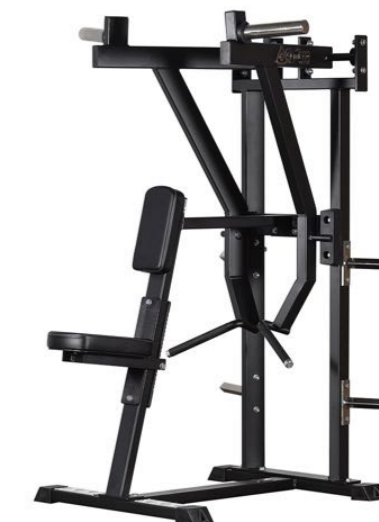
Iso Lateral Low Row Art.nr: 012

Length: 120 cm Width: 112 cm Height: 174 cm