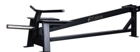
T-bar Row Art.nr: 115

Length: 206 cm Width: 86 cm Height: 47 cm