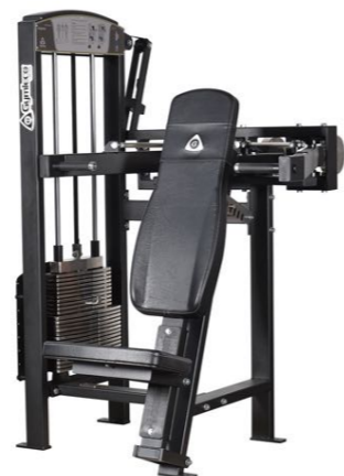
Shoulder Press Seated Art.nr: 330

Length: 155 cm Width: 125 cm Height: 165 cm