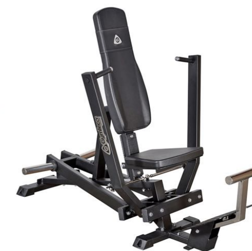
Lateral Wide Chest Art.nr: 021

Length: 180 cm Width: 104 cm Height: 137 cm