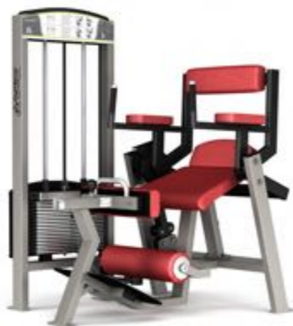
Lumbar/Abdominal Combination Art.nr: 365B

Length: 100 cm Width: 90 cm Height: 160 cm