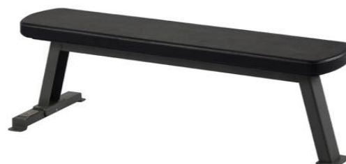
Flat Bench Fixed Art.nr: 191

Length: 124 cm Width: 45 cm Height: 43,5 cm