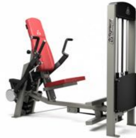
Dips press/Shoulder Pull Combination Art.nr: 354

Length: 174 cm Width: 85 cm Height: 136 cm