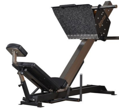
Leg Press Art.nr: 243

Length: 218 cm Width: 78 cm Height: 142 cm