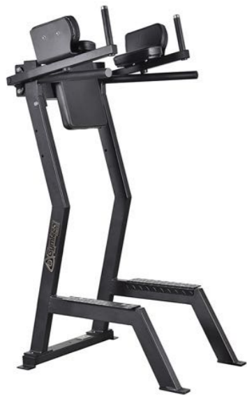
Leg Rise (abs training) Art.nr: 173

Length: 70 cm Width: 91 cm Height: 143 cm