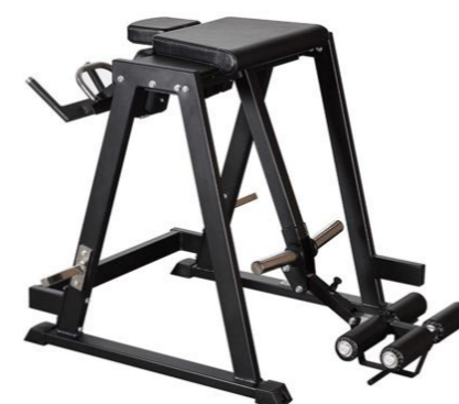
Reverse Hyper Pendulum Art.nr: 062

Length: 137 cm Width: 133,5 cm Height: 111 cm