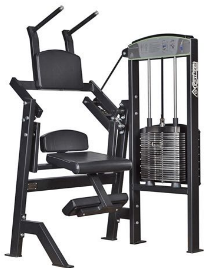
Abdominal Seated Art.nr: 370

Length: 170 cm Width: 101 cm Height: 104 cm