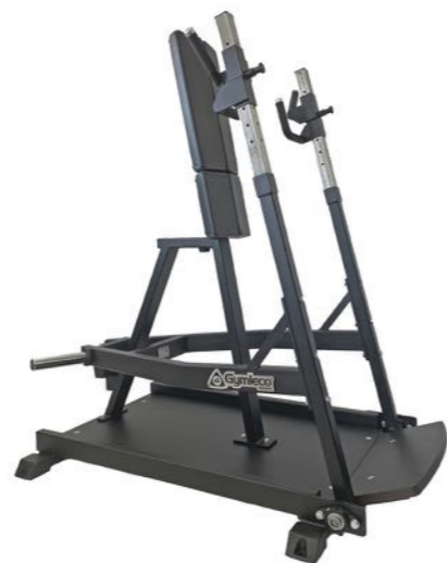
Chest Press, Standing Art.nr: 028

Length: 152 cm Width: 100 cm Height: 163 cm