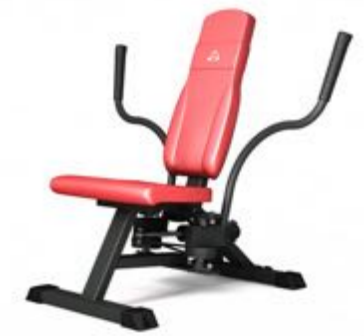
Pec Dec/Rear Deltoid Shoulder Art.nr: 935

Length: 94 cm Width: 146 cm Height: 104 cm