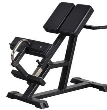
Belly Back 45 degrees Art.nr: 162F45

Length: 102 cm Width: 60 cm Height: 117 cm