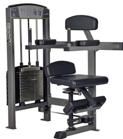
Waist Trainer Seated Art.nr: 375

Length: 120 cm Width: 75 cm Height: 139 cm