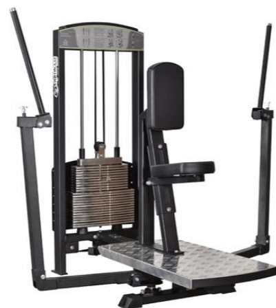
Pec Deck Combination Art.nr: 335

Length: 147 cm Width: 70 - 174 cm Height: 149 cm