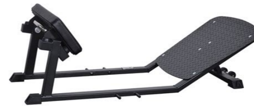
Hip Thrust bench Art.nr: 166

Length: 150 cm Width: 73 cm Height: 50 cm