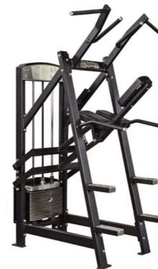
Power Station (chins and dips) Art.nr: 314

Length: 126 cm Width: 120 cm Height: 200 cm