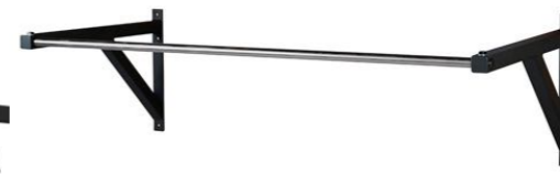
Chins Rack with wall hold Art.nr: 110V

Length: 145 cm Width: 61,5 cm Height: 42 cm