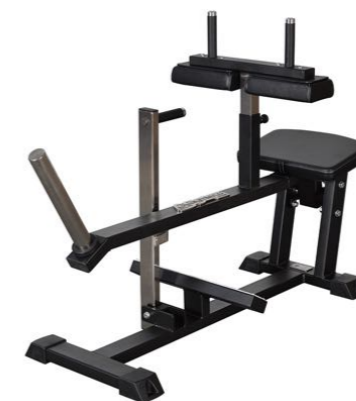
Calf Raise: Seated Art.nr: 145

Length: 140 cm Width: 60 cm Height: 85 cm