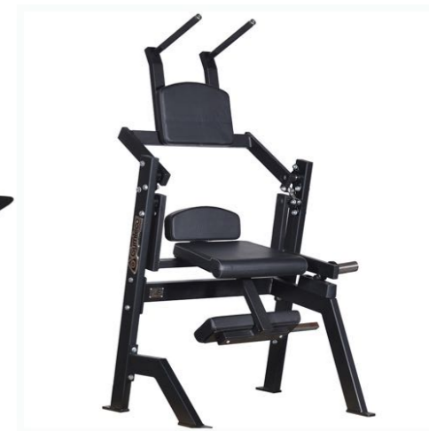
Abdominal Seated Art.nr: 070

Length: 83 cm Width: 114 cm Height: 168 cm