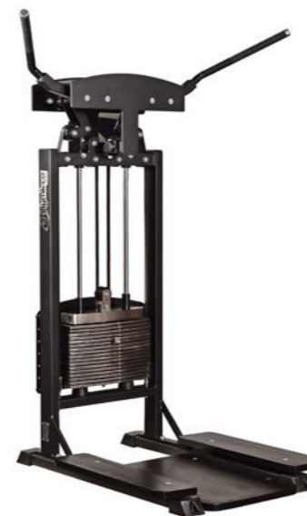
Wide Chest Standing Art.nr: 326

Length: 112 cm Width: 135 cm Height: 177 cm