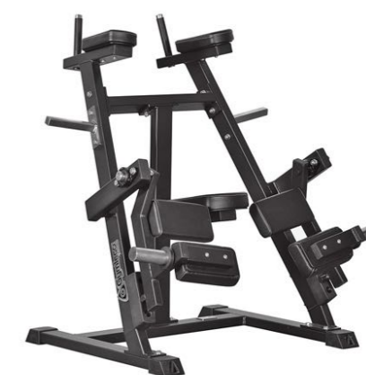
Iso Lateral Leg Curl Standing Art.nr: 042

Length: 96 cm Width: 117 cm Height: 123 cm