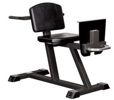
Belly Back Knee standing Art.nr: 163

Length: 105 cm Width: 59 cm Height: 79 cm