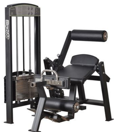
Lumbar/Abdominal Combination Art.nr: 365A

Length: 100 cm Width: 90 cm Height: 160 cm