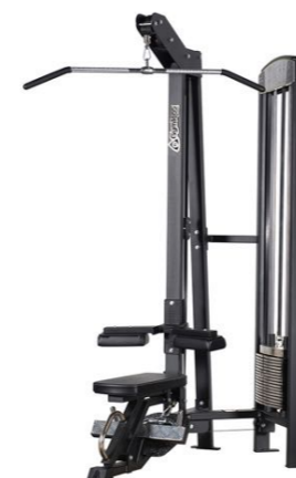
Lateral Pulldown/Seated Row Combination Art.nr: 214

Length: 112 cm Width: 132 - 213 cm Height: 225 cm