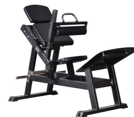
Hip Thrust Art.nr: 066

Length: 160 cm Width: 96 cm Height: 124 cm