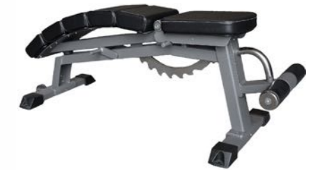
Decline Bench Curved, Adjustable -15+85 degree Art.nr: 193S

Length: 133 cm Width: 45 cm Height: 42 - 115 cm