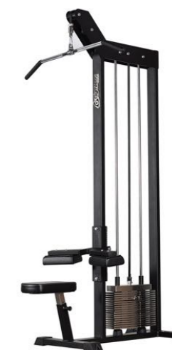
Lateral Pulldown Rehab Art.nr: 211R

Length: 124 cm Width: 52 cm Height: 227,5 cm