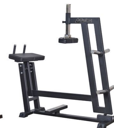
Donkey Raise Art.nr: 046

Length: 146 cm Width: 65 cm Height: 156 cm