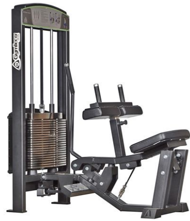
Seated Calf Raises Art.nr: 345

Length: 120 cm Width: 60 cm Height: 140 cm