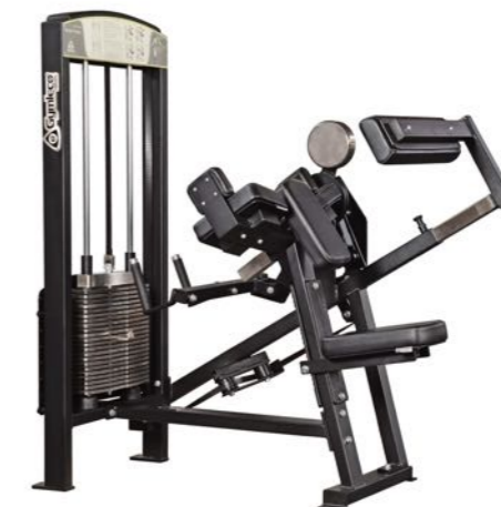
Biceps/Triceps Combination Art.nr: 355

Length: 129 cm Width: 84 cm Height: 149 cm