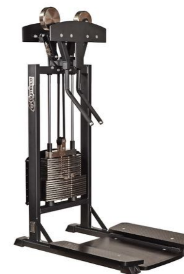
Shoulder Rotation Standing Art.nr: 334

Length: 112 cm Width: 82 cm Height: 167 cm