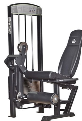
Leg Extension Art.nr: 340

Length: 95 cm Width: 99 cm Height: 162 cm