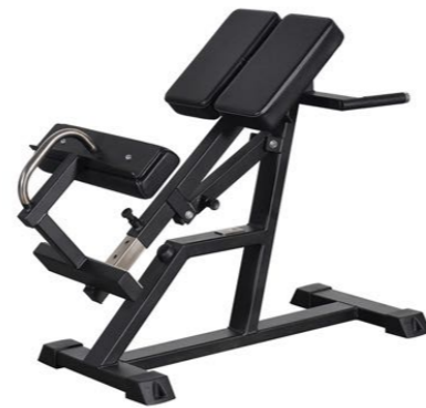
Belly Back Adjustable Art.nr: 162

Length: 102 cm Width: 60 cm Height: 117 cm