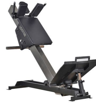
Hack Squat Art.nr: 244

Length: 195 cm Width: 80 cm Height: 145 cm