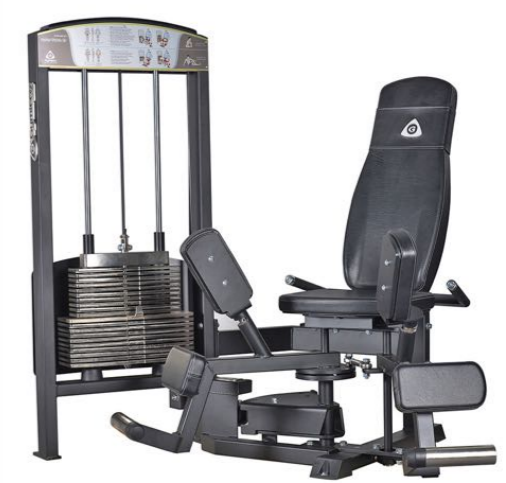
Adductor/Abductor Art.nr: 364

Length: 130 cm Width: 86 cm Height: 137 cm