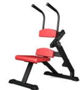
Lumbar/Abdominal Art.nr: 965

Length: 133 cm Width: 71 cm Height: 113 cm Weight: 56 kg