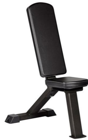
Fixed Bench 70 degrees Art.nr: 153

Length: 76 cm Width: 40 cm Height: 92 cm