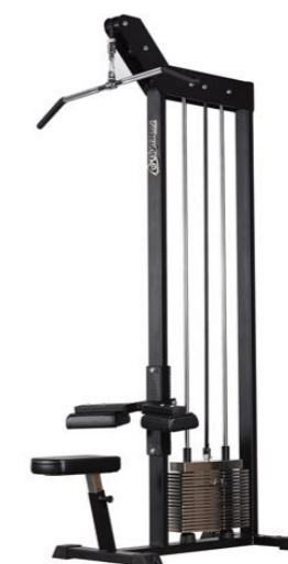
Lateral Pulldown Art.nr: 211

Length: 124 cm Width: 52 cm Height: 227,5 cm