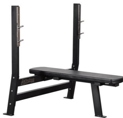
Bench Press Stand with Fixed bar supports Art.nr: 122F

Length: 123 cm Width: 123 cm Height: 124 cm