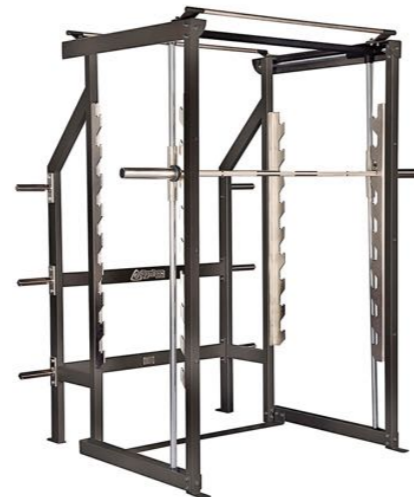
Multi Smith Machine Art.nr: 285

Length: 207 cm Width: 149 cm Height: 220 cm