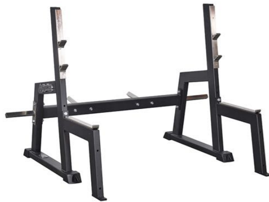
Stand for Decline Bench Art.nr: 154

Length: 125 cm Width: 170 cm Height: 110 cm