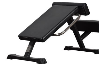
Abdominal Bench (Romain Chair) Art.nr: 170

Length: 102 cm Width: 58 cm Height: 57 cm