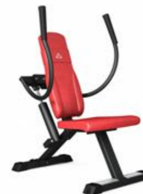
Biceps / Triceps Art.nr: 955

Length: 101 cm Width: 76 cm Height: 124 cm Weight: 45 kg