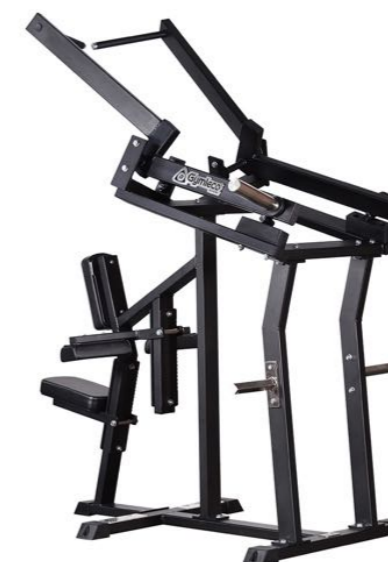
Iso Lateral Pulldown Art.nr: 011

Length: 156 cm Width: 104 cm Height: 199 cm