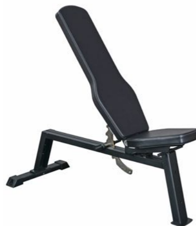
Adjustable Bench Art.nr: 190

Length: 125 cm Width: 45 cm Height: 43,5 cm