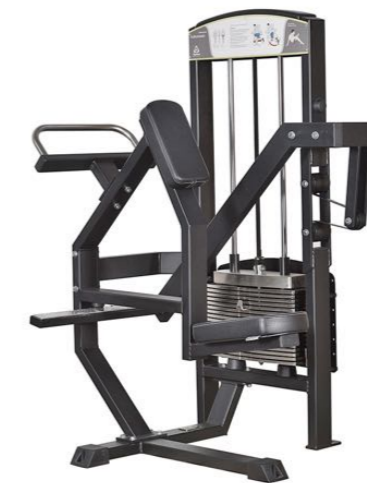
Gluteus Machine Art.nr: 360

Length: 86 cm Width: 75 cm Height: 136 cm