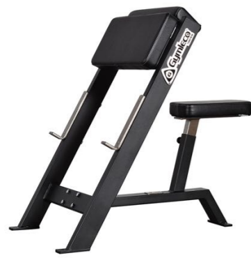
Scott curl bench seated Art.nr: 151

Length: 101 cm Width: 70 cm Height: 95 cm