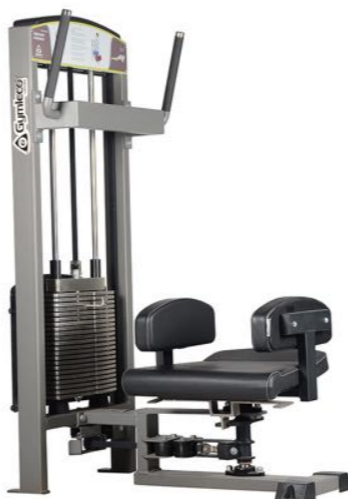
Waist Trainer Kneestanding Art.nr: 376

Length: 95 cm Width: 65 cm Height: 125 cm