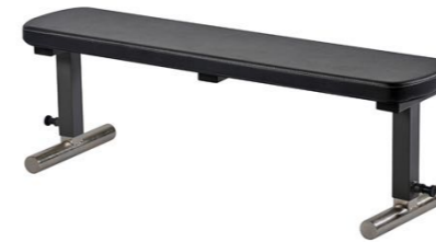
Flat Bench Adjustable Art.nr: 192

Length: 122 cm Width: 35,5 cm Height: 56 cm