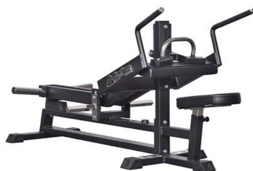
Dip Press Art.nr: 055

Length: 190 cm Width: 70 cm Height: 90 cm