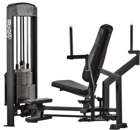
Iso Lateral Pec Deck Art.nr: 323

Length: 146 cm Width: 171 cm Height: 150 cm