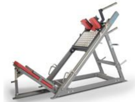
Leg Press/Hack Squat Combination Art.nr: 245

Length: 230 cm Width: 81 cm Height: 145 cm