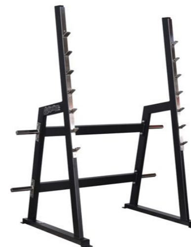
Squat Rack Art.nr: 148

Length: 162 cm Width: 100 cm Height: 186 cm