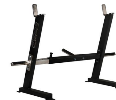
Curl bar rack Art.nr: 150

Length: 70 cm Width: 95 cm Height: 127 cm