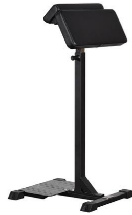
Scott curl bench standing Art.nr: 152

Length: 63 cm Width: 53 cm Height: 92 cm