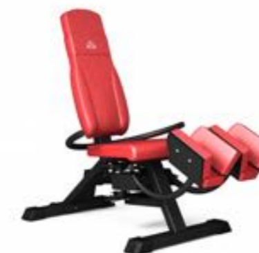
Adductor/Abductor Art.nr: 964

Length: 101 cm Width: 76 cm Height: 124 cm Weight: 45 kg