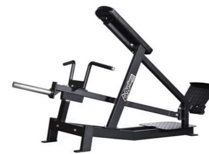
Incline T-bar row with Breast Cushion Art.nr: 116

Length: 219 cm Width: 92 cm Height: 109 cm