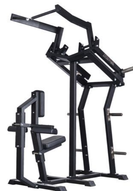
Iso Lateral High Row Art.nr: 013

Length: 160 cm Width: 110 cm Height: 198 cm