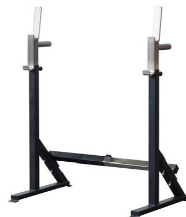
Bench Press and Squat Stand Art.nr: 142

Length: 128 cm Width: 69 cm Height: 75 - 163 cm