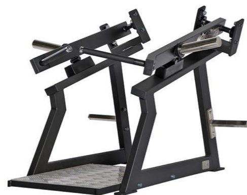
Iso Lateral Upright Row Art.nr: 032

Length: 120 cm Width: 140 cm Height: 94 cm