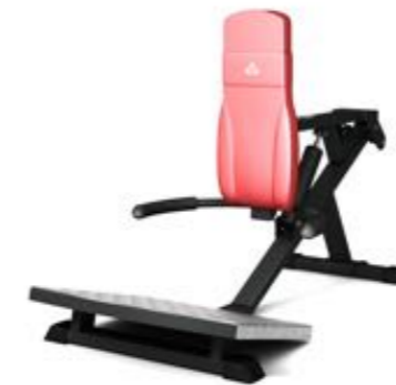
Hack squat Art.nr: 944

Length: 173 cm Width: 86 cm Height: 107 cm