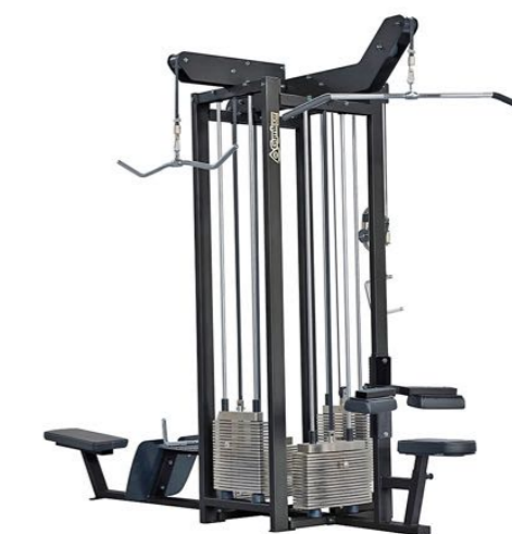
Four Station Art.nr: 215

Length: 323 cm Width: 58 cm Height: 243 cm Cable Cross: 60 kg Row: 100 kg Pulldown: 100 kg Triceps: 60 kg