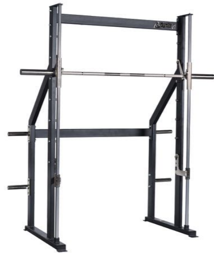
Smith Machine Art.nr: 280

Length: 207 cm Width: 90 cm Height: 208 cm