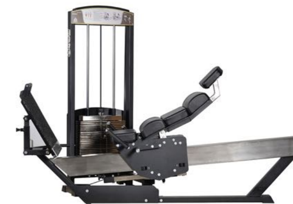
Leg Press Adjustable Art.nr: 343

Length: 221 cm Width: 116 cm Height: 162 cm