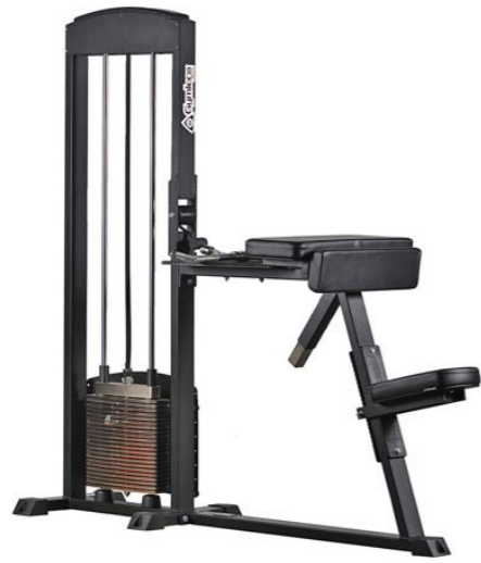
Lateral Biceps/Triceps Art.nr: 255

Length: 192 cm Width: 60 cm Height: 180 cm