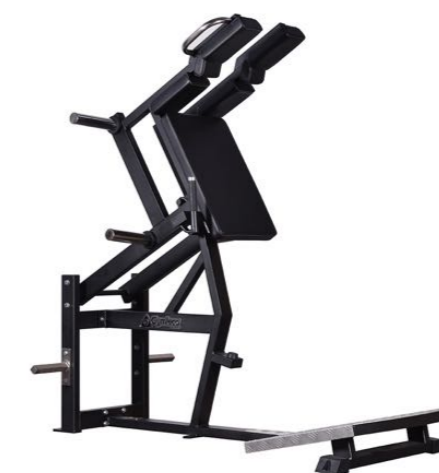
Squat / Hack Squat Art.nr: 044

Length: 177 cm Width: 85 cm Height: 156 cm