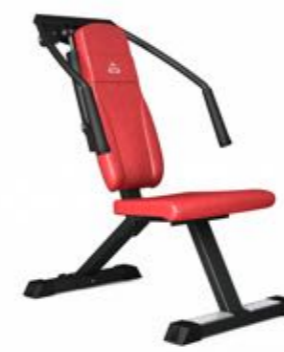
Pulldown and shoulderpress Art.nr: 911

Length: 113 cm Width: 69 cm Height: 115 cm