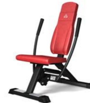
Chest press and back Art.nr: 921

Length: 94 cm Width: 57 cm Height: 104 cm