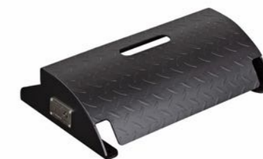
Calf Block Art.nr: 146

Length: 51 cm Width: 31 cm Height: 13 cm