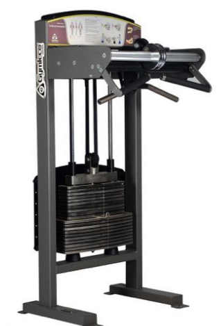
Forearm Machine Art.nr: 356

Length: 61 cm Width: 75 cm Height: 136 cm