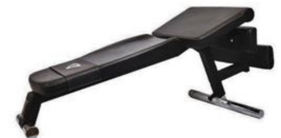
Decline Bench Adjustable Art.nr: 194R

Length: 148 cm Width: 60 cm Height: 60 cm