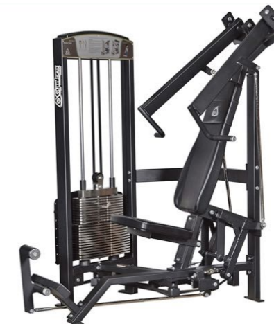
Incline Chest Press Art.nr: 320

Length: 156 cm Width: 122 cm Height: 173 cm