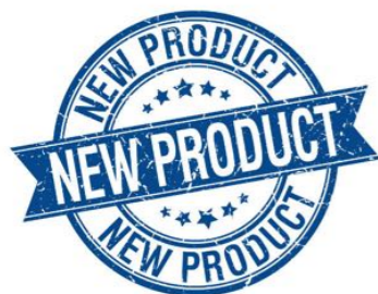
Leg Press Art.nr: 943