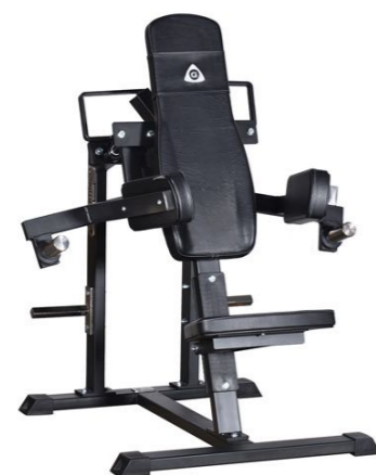
Iso Lateral Shoulder Rotation Art.nr: 031

Length: 105 cm Width: 114 cm Height: 135 cm