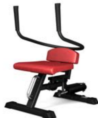
Waist Trainer Art.nr: 975

Length: 89 cm Width: 66 cm Height: 104 cm