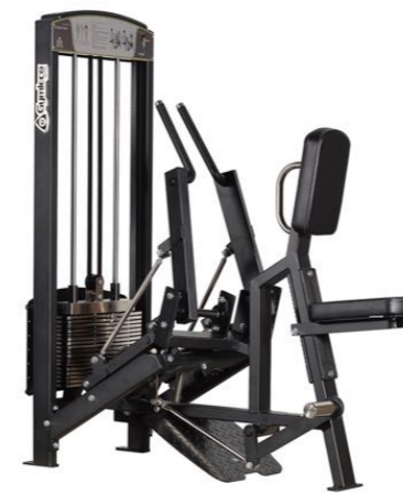
Seated Row Art.nr: 310

Length: 120 cm Width: 60 cm Height: 162 cm