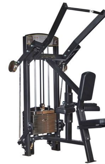
Lateral Pulldown Art.nr: 311

Length: 126 cm Width: 95 cm Height: 186 cm