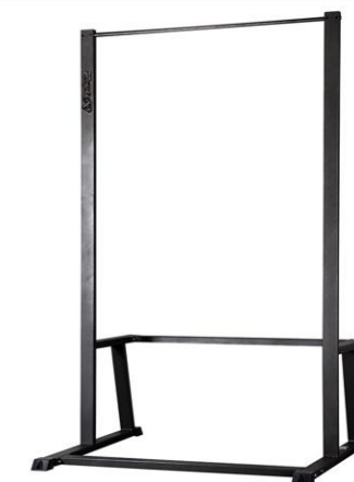
Chins Rack Detached Art.nr: 111

Length: 126 cm Width: 150 cm Height: 240 cm