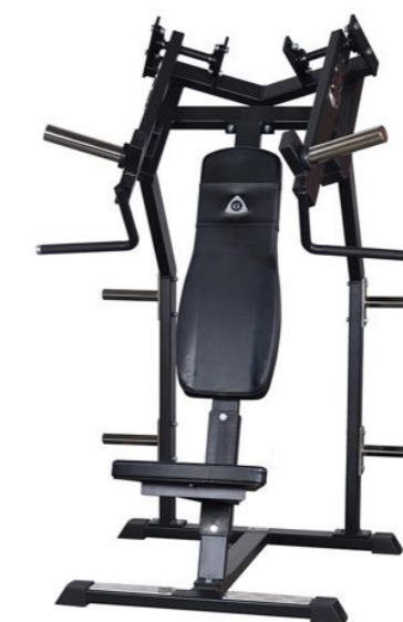
Lateral Incline Press Art.nr: 020

Length: 110 cm Width: 113 cm Height: 177 cm