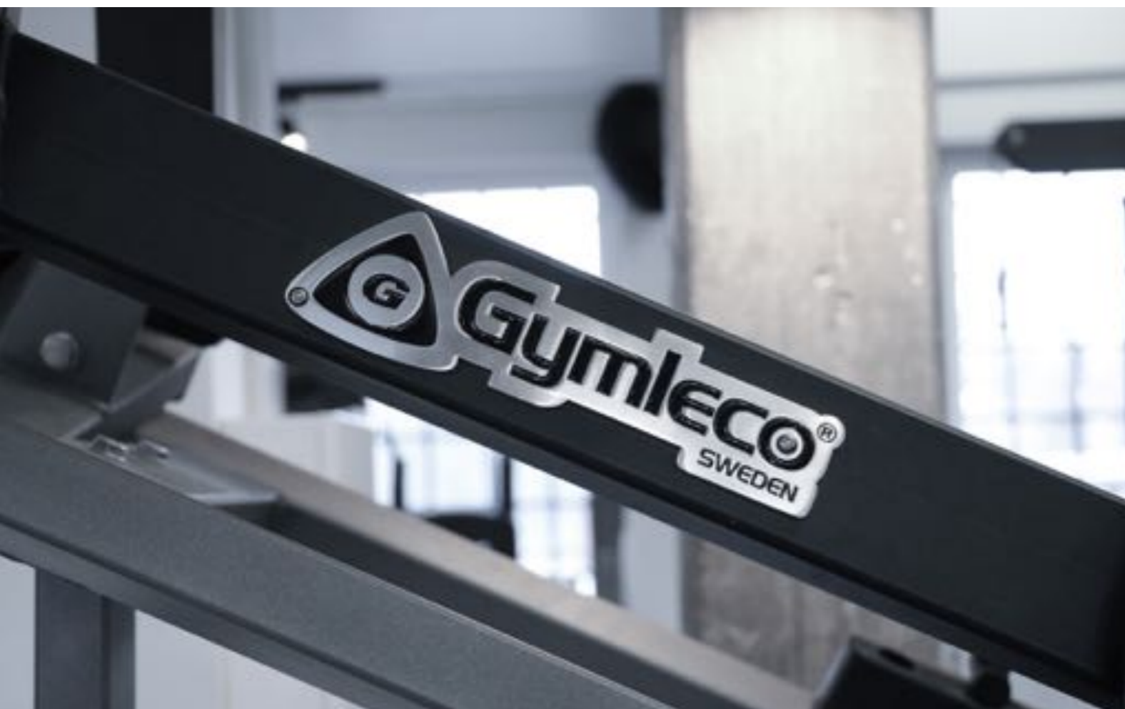
Lateral Pulldown position