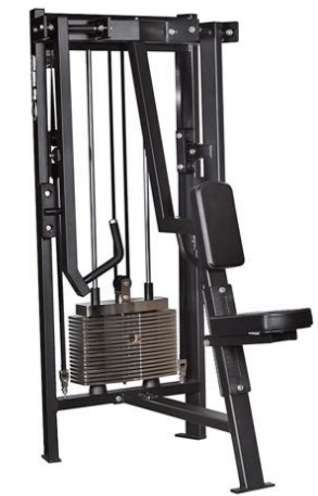
Iso Lateral Low Row Art.nr: 312

Length: 121 cm Width: 81 cm Height: 166 cm