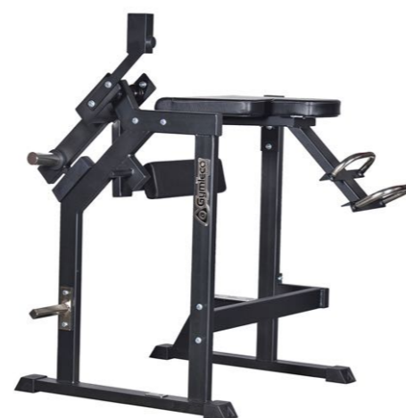
Reverse Hyper Art.nr: 061

Length: 116 cm Width: 140 cm Height: 144 cm