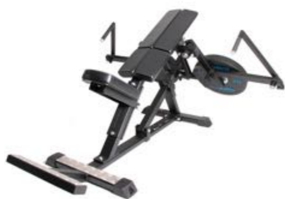
Pec Deck, Individual arms Art.nr: 023

Length: 155 cm Width: 164 cm Height: 93 cm