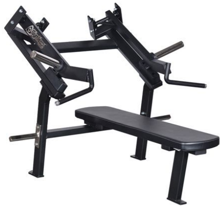
Iso Lateral Bench Press Art.nr: 022

Length: 163 cm Width: 133 cm Height: 114 cm