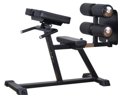
Glute Ham Rise Art.nr: 141

Length: 110 cm Width: 60 cm Height: 90 cm