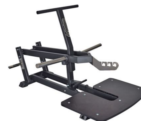
Belt Squat Machine Art.nr: 082

Length: 170 cm Width: 100 cm Height: 115 cm