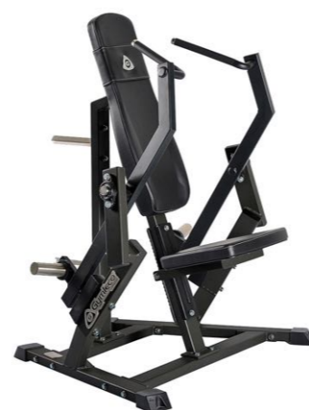
Iso Lateral Triceps Art.nr: 051

Length: 124 cm Width: 102 cm Height: 136 cm