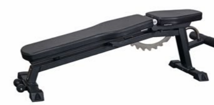
Decline Bench Art.nr: 193

Length: 133 cm Width: 45 cm Height: 42 - 115 cm