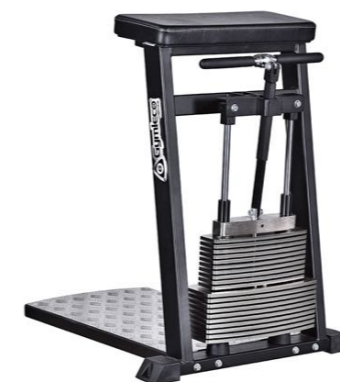
Forearm Curl Art.nr: 357

Length: 93 cm Width: 78 cm Height: 103 cm