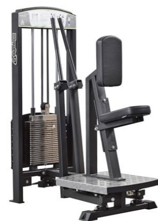
Rear Deltoid Shoulder Art.nr: 333

Length: 147 cm Width: 70 - 174 cm Height: 149 cm