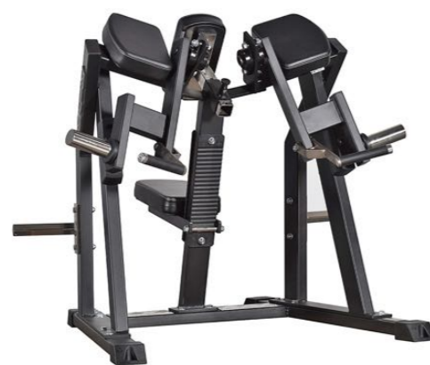
Iso Lateral Biceps Art.nr: 050

Length: 104 cm Width: 120 cm Height: 103 cm