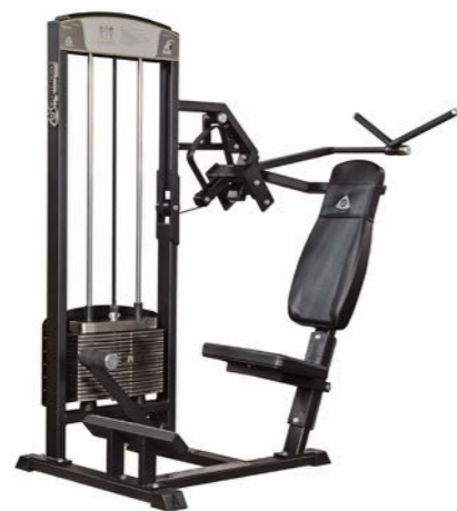
Pullover with handles Art.nr: 324

Length: 143 cm Width: 89 cm Height: 172 cm