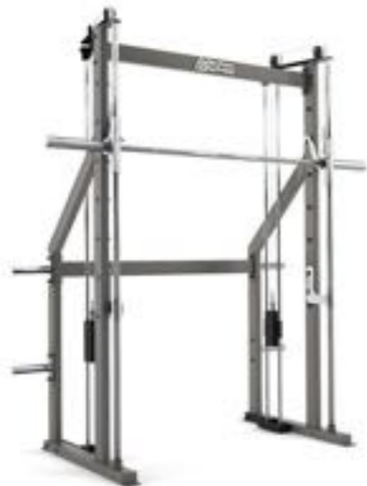
Smith Machine with Counterweight Art.nr: 281

Length: 230 cm Width: 81 cm Height: 145 cm