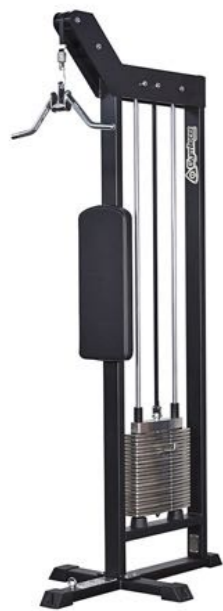
Lateral Triceps Pushdown Art.nr: 251

Length: 110 cm Width: 70 cm Height: 223 cm