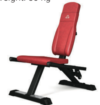
Shoulder lift/Dips Art.nr: 954

Length: 113 cm Width: 69 cm Height: 115 cm