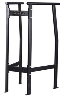
Dip-press stand Art.nr: 155

Length: 80 cm Width: 80 cm Height: 140 cm