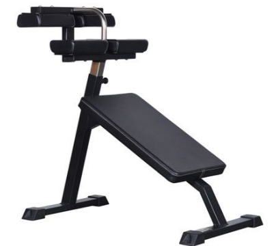
Abdominal bench Plus Art.nr: 171

Length: 102 cm Width: 58 cm Height: 105 cm