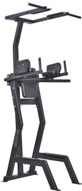
Leg Rise with Chins Art.nr: 179

Length: 70 cm Width: 91 cm Height: 227 cm