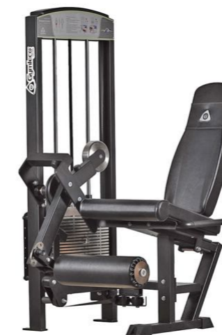
Leg Extension Rehab Art.nr: 340R

Length: 95 cm Width: 99 cm Height: 162 cm