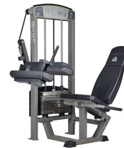
Leg Curl Seated Art.nr: 341

Length: 100 cm Width: 136 cm Height: 148 cm