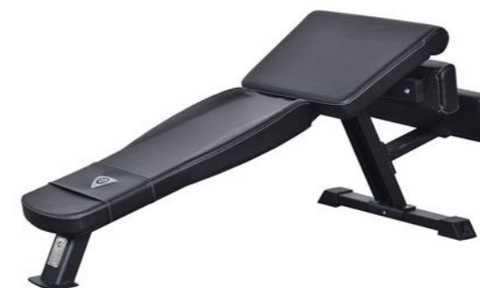
Decline Bench Fixed Art.nr: 194

Length: 148 cm Width: 60 cm Height: 60 cm