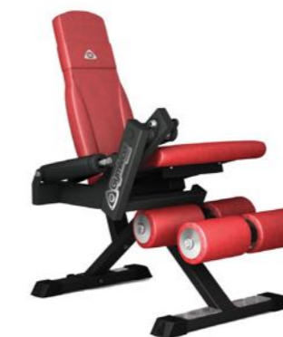
Leg extension/legcurl Art.nr: 949

Length: 105 cm Width: 77 cm Height: 117 cm