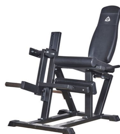
Leg Extension Art.nr: 040

Length: 92 cm Width: 120 cm Height: 130 cm