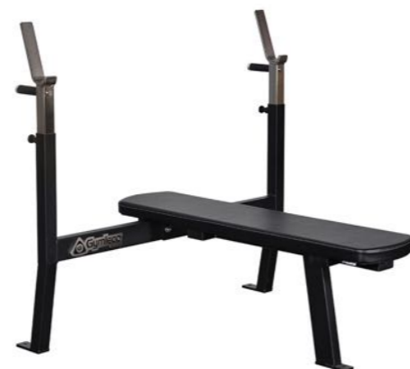
Bench Press Stand with Adjustable bar supports Art.nr: 122R

Length: 125 cm Width: 123 cm Height: 104 cm