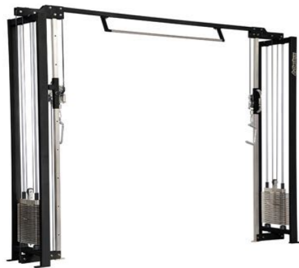
Cable Cross / Multigym Art.nr: 225

Cable Cross: 60 kg x2 Row: 100 kg x2 Pulldown: 100 kg x2 Triceps: 60 kg x2