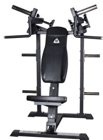
Iso Lateral Shoulder Press Art.nr: 030

Length: 130 cm Width: 114 cm Height: 149 cm