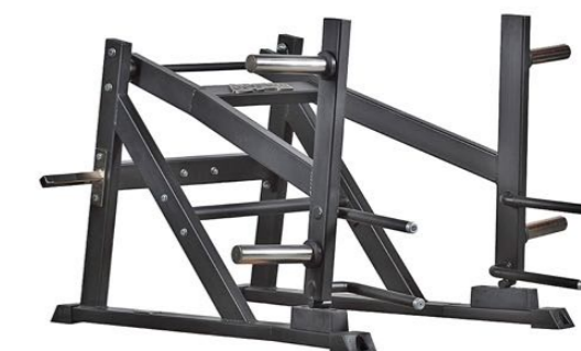
Deadlift / Squat machine Art.nr: 083

Length: 140 cm Width: 130 cm Height: 82 cm