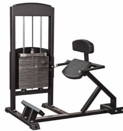
Calf Raise 45 Degree Art.nr: 348

Length: 150 cm Width: 86 cm Height: 146 cm