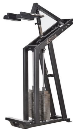
Calf Raise Standing Art.nr: 347

Length: 130 cm Width: 60 cm Height: 180 cm