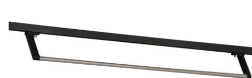
Chin Rack for Cable Cross Art.nr: 110K