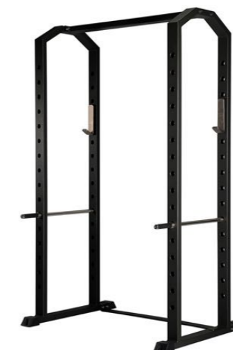
Power Rack Art.nr: 149

Length: 122 cm Width: 90 cm Height: 205 cm