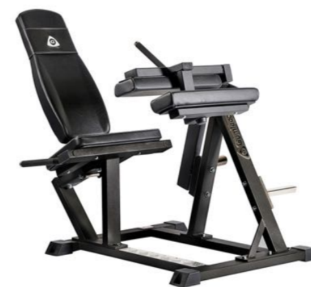
Leg Curl Seated Art.nr: 041

Length: 125 cm Width: 100 cm Height: 110 cm