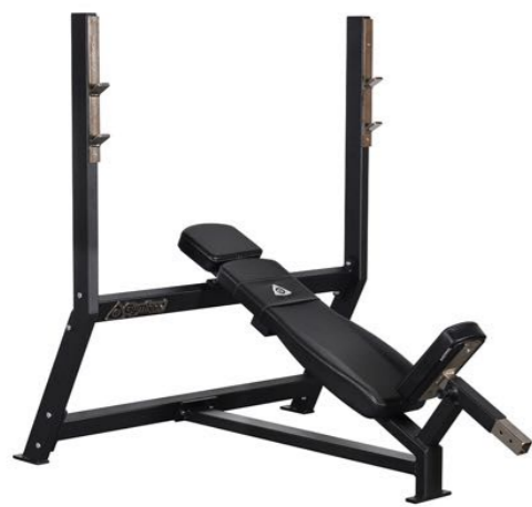
Incline Bench Press with foot support Art.nr: 120

Length: 125 cm Width: 150 cm Height: 124 cm