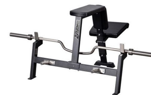
Seal Rowing Bench Art.nr: 117

Length: 147 cm Width: 122,5 cm Height: 91 cm