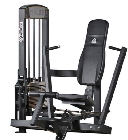
Chest Press Seated Art.nr: 321

Length: 139 cm Width: 137 cm Height: 149 cm