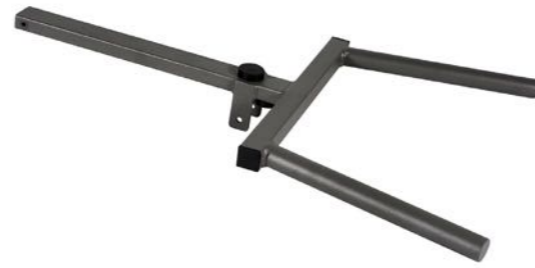
Dip for Brutal Bench Art.nr: 174-1