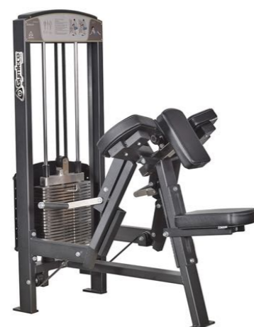
Biceps Machine Art.nr: 350

Length: 100 cm Width: 95 cm Height: 153 cm