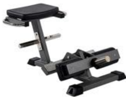
Tibia Dorsi Flexion Art.nr: 047

Length: 102 cm Width: 60 cm Height: 51 cm