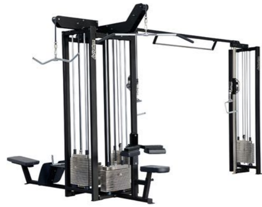
4 Station With Cable Cross / Multigym Art.nr: 215K

Length: 410 cm Width: 323 cm Height: 243 cm