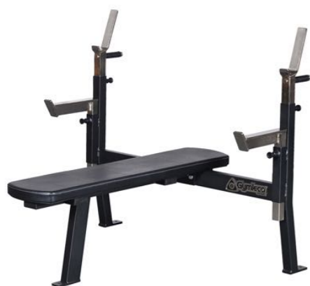
Bench Press with Safety Bars Art.nr: 122RS

Length: 125 cm Width: 124 cm Height: 104 cm