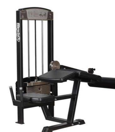
Lying Leg Curl Rehab Art.nr: 342R

Length: 170 cm Width: 97 cm Height: 149 cm