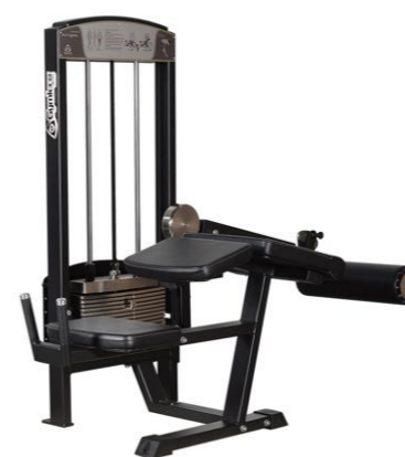
Lying Leg Curl Art.nr: 342

Length: 170 cm Width: 97 cm Height: 149 cm