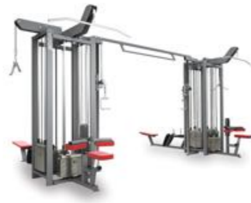
8 Station With Cable Cross / Multigym Art.nr: 215DK

Cable Cross: 60 kg x 2 Row: 100 kg Pulldown: 100 kg Triceps: 60 kg