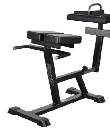
Belly Back 90 degrees Art.nr: 162F90

Length: 102 cm Width: 60 cm Height: 104 cm